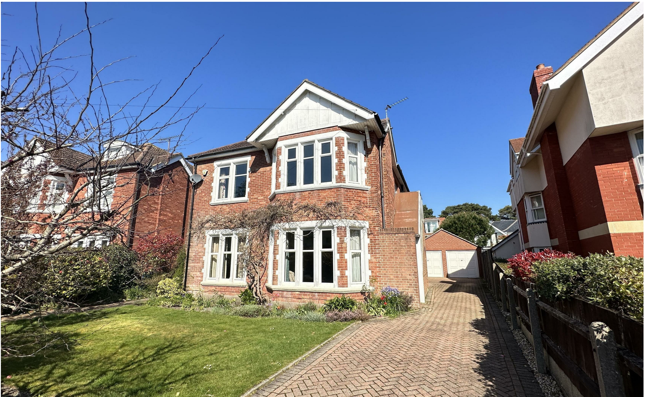
21 Flaghead Road, Canford Cliffs, Poole BH13 7JW £1,450,000 Freehold